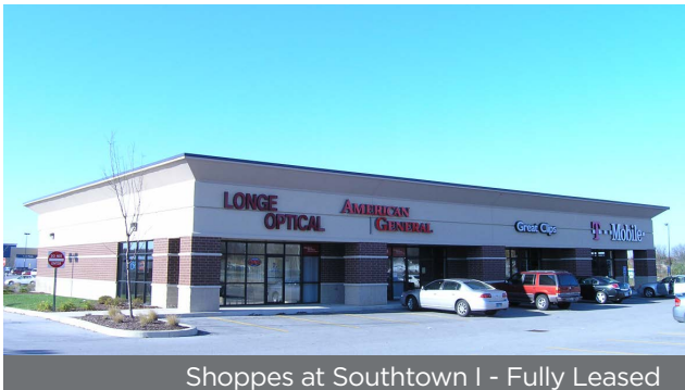
Shoppes at Southtown I - Fully Leased

Spaces are available to lease from 1,000 SF. A 10-Year "Step Up" tax abatement will pass through to Tenants.